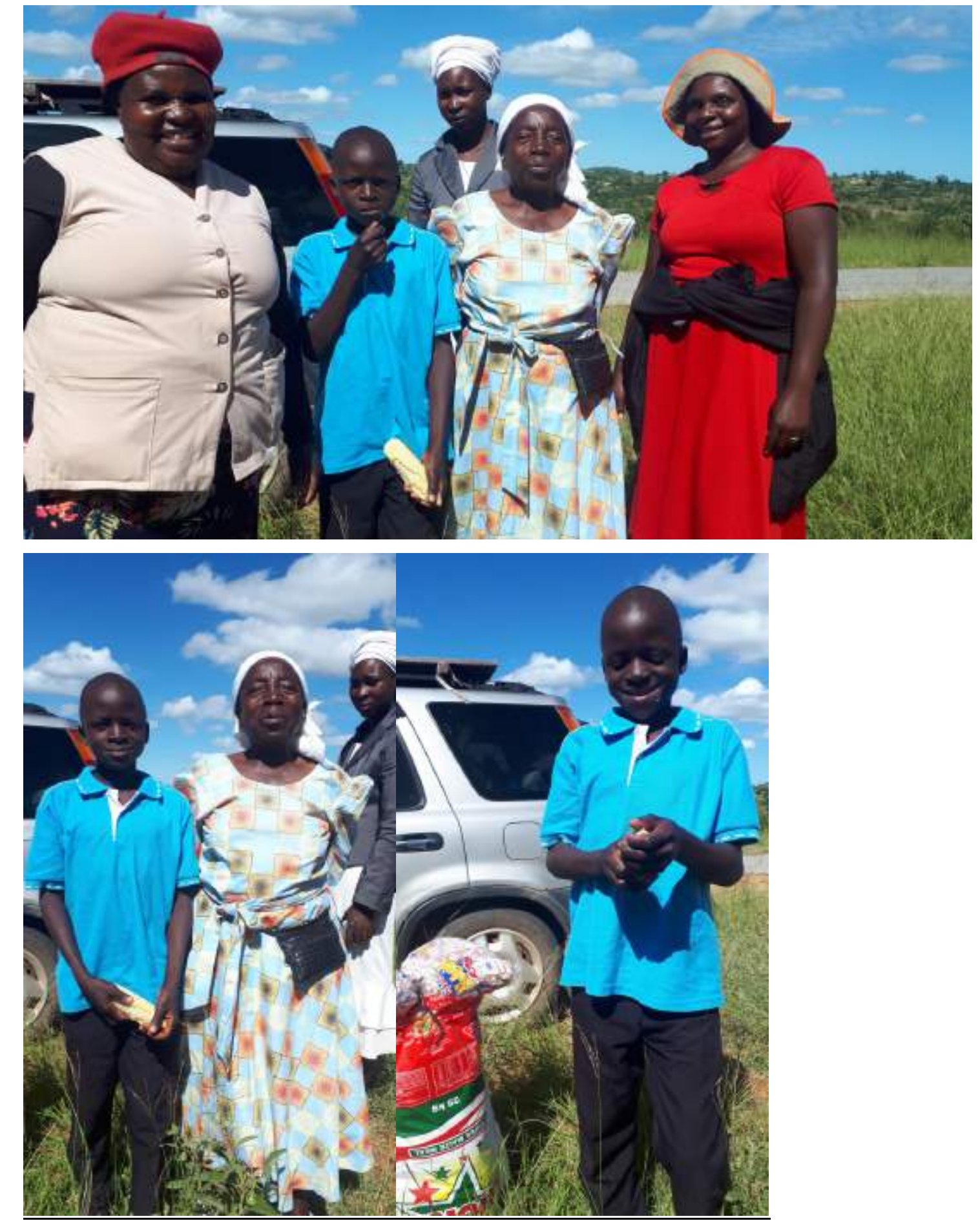
45 March 2020 Report – For the Love of our kids