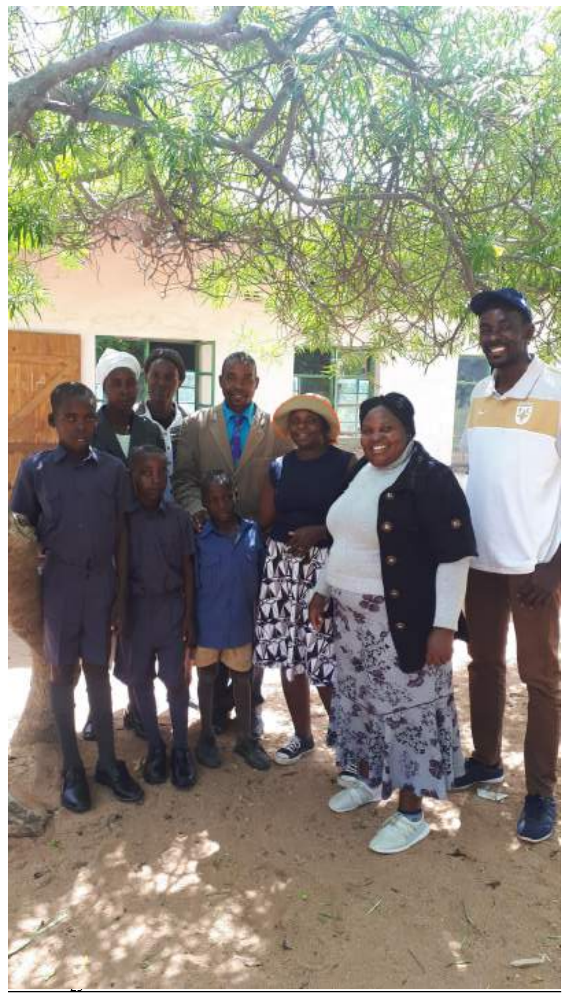
March 2020 Report – For the Love of our kids