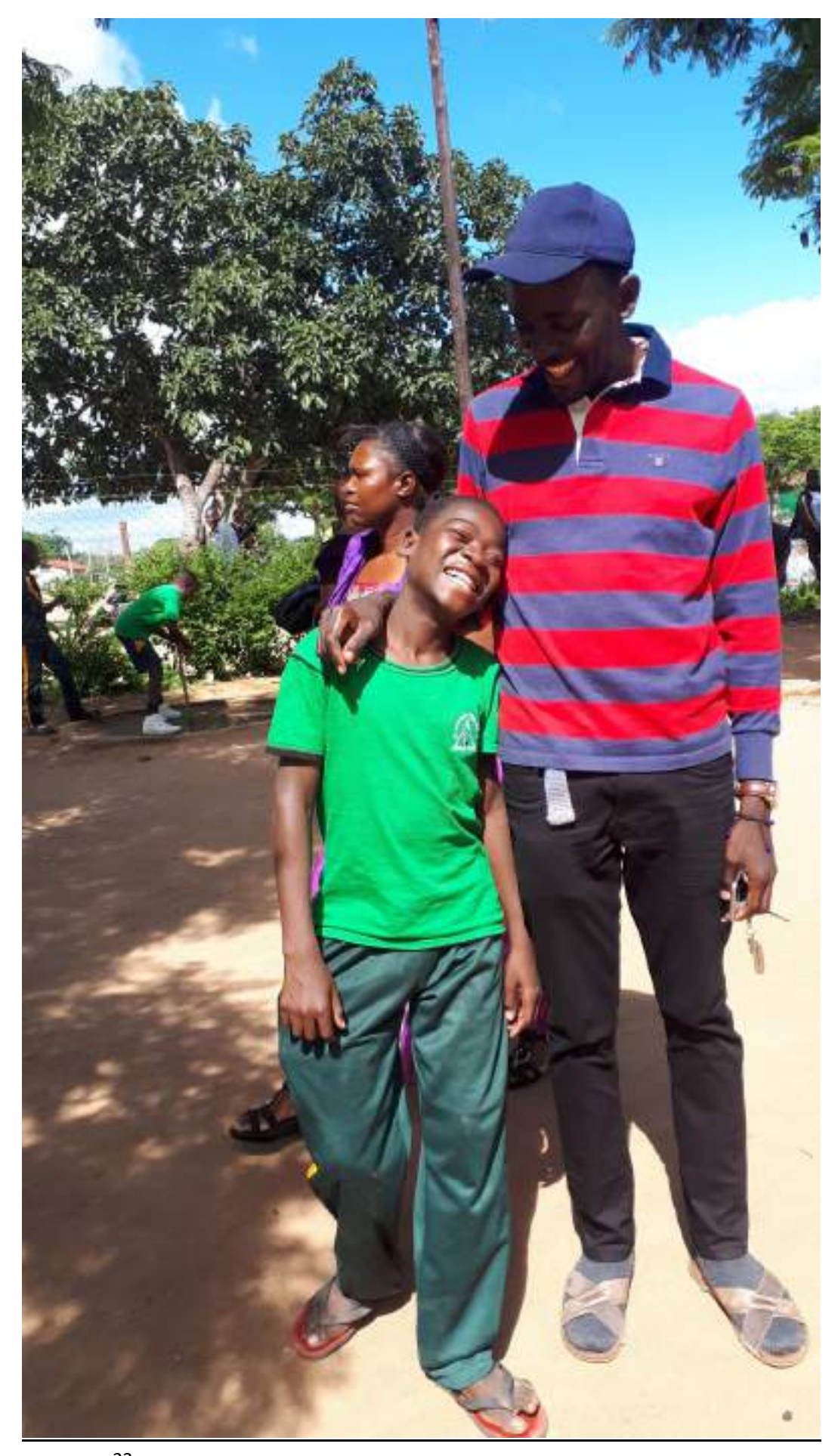
22 March 2020 Report – For the Love of our kids