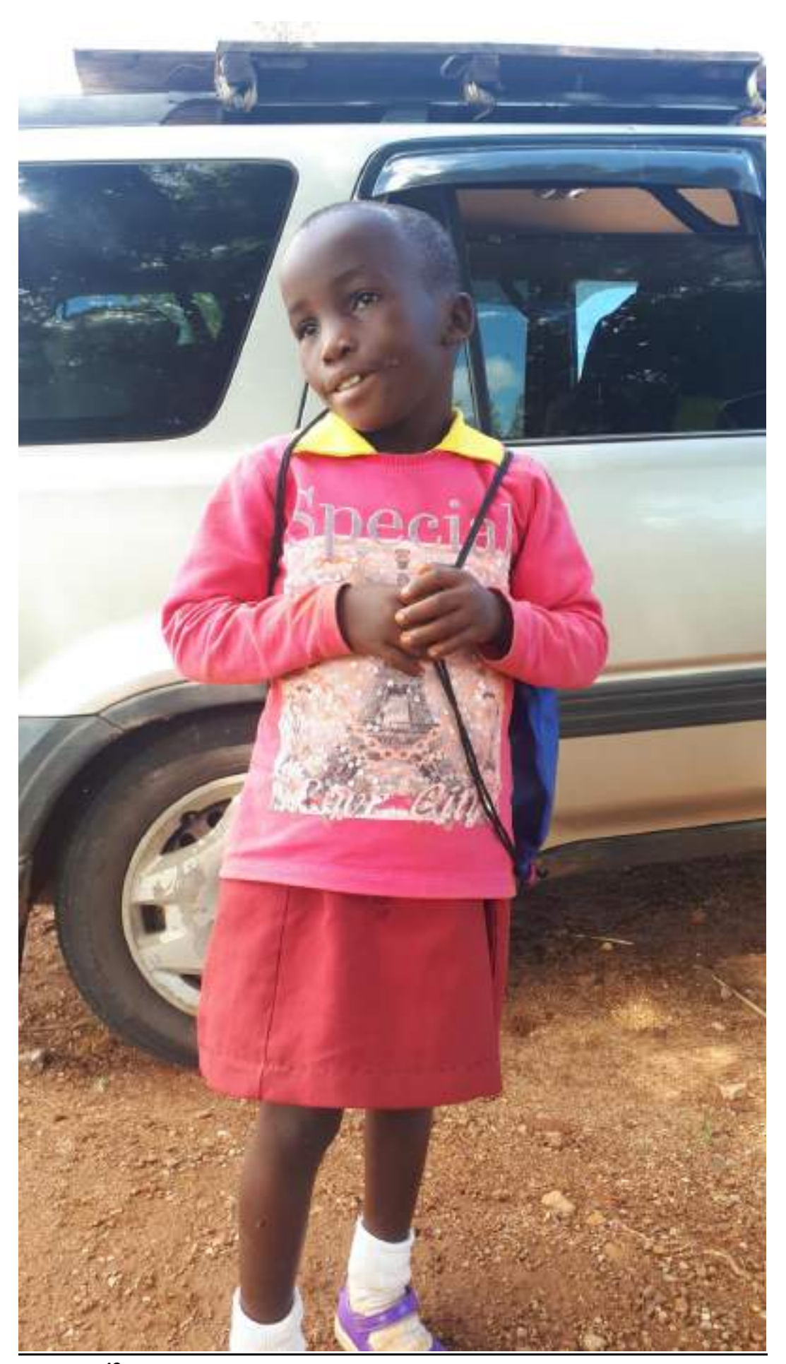
42 March 2020 Report – For the Love of our kids